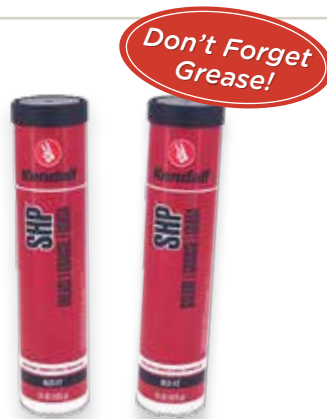
SHP Grease Item #24211