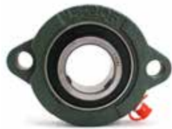
Flange Bearing Item #48011