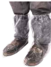
Item #70001 *Fits up to size 12*