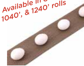
XF966 3 3/4" Heavy Tan Egg Belt Item #62038-0840, 62038-1040, 62038-1240