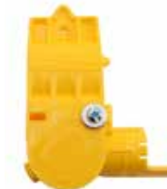
Short Swing Mate Item #35725