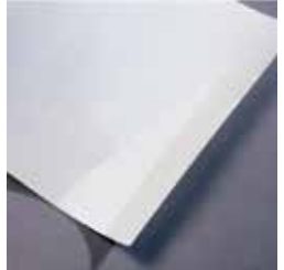
Manure Belt 85" X 1040" Item #61850