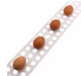
Reinforced Perforated Polypropylene Egg Belt Item #61041-1020-Reinforced & 61041-1220-Reinforced