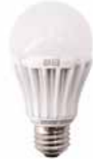
9.9W LED Frosted Dimmable Poultry Bulb - 5000K Item #28100