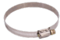
Stainless Steel Hose Clamp - 3" - 4" Item #26005