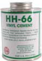
Vinyl Curtain Repair Glue Item #10001