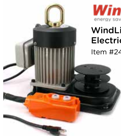
WindLift 2000 Electric Ceiling Winch Item #24021