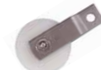
2 1/2" w/ Stainless Steel Straps and Hardware Item #18255-SS