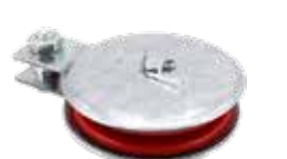
2 1/2" Red Nylon Composite w/ Shields Item #18258