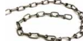
#2 Stainless Steel Double Loop X 100' Item #19602-SS