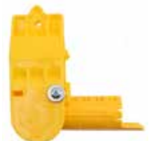
Long Swing Mate Item #35726