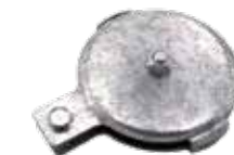
4 1/2" Cast Bearing w/ Shields Item #18455