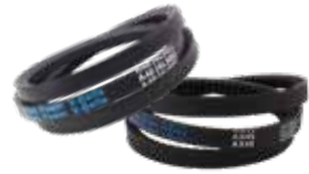
Prime V-Belts *Classical and cogged styles ranging from size A21 to A91*