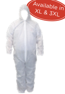
Item #70011-50PK & #70013-50PK