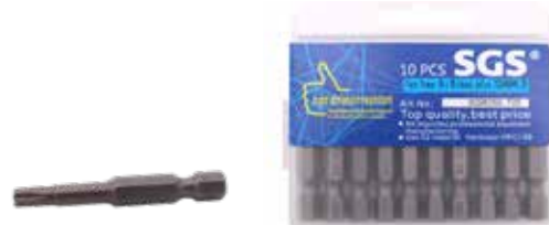
Torx 2" Impact Screw Bit