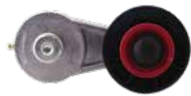
Automatic Belt Tensioner Item #48020