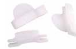
Plastic Hold Down Clip Item #66401