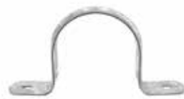
Metal Pipe Strap with 2 Holes - 3" Item #26015