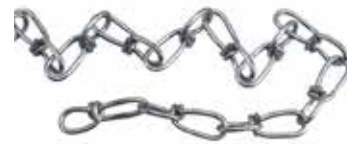
#2 Galvanized Steel Double Loop X 200' Item #19602