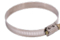
Stainless Steel Hose Clamp - 2 9/16" - 3 1/2" Item #26004

Founded in 1975 to provide quality products to the poultry industry, Agricultural Mfg. & Textiles is now in its third generation of family ownership. Over the years, we have expanded our product line solution for broiler, breeder and layer houses, as well as many items from swine, dairy, and greenhouses.